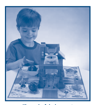
The colorful play mat guides your setup!